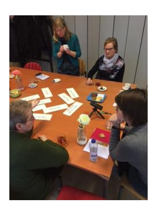
Figure 9 User workshop Seniornwltijn, Vlaardingen Rotterdam, Netherlands