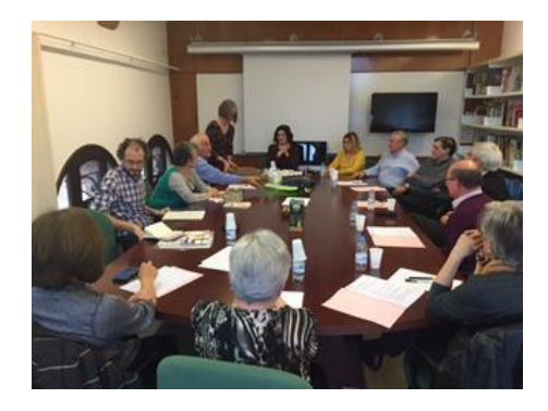
Figure 11 User workshop at UAB Barcelona, Spain