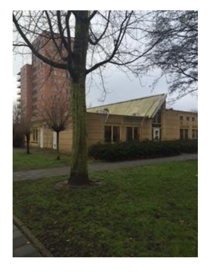
Figure 8 Seniornwltijn, Vlaardingen, Rotterdam, Netherlands