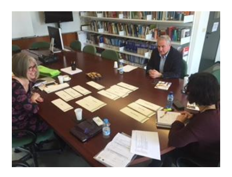
Figure 5 meeting and briefing with UAB, Spain

Each visit also included the opportunity to visit the broader environments where older people live, to meet with partners and to share reflections and findings from each country partner visit in order to communicate broader insights (and relate this to environments where the potential technological innovation might be used).