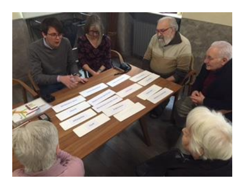
Figure 10 User workshop Oasi San Gerardo within the La Meridiana Facility, Monza, Italy