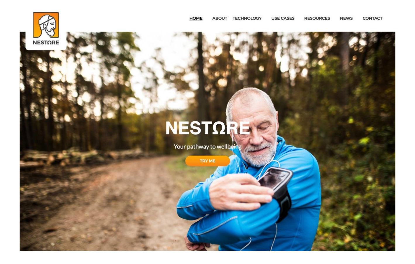
Figure 1 - NESTORE Website Home Page

The NESTORE website aims to serve both scientific and lay audiences with content addressed to both targets. The concept thus aims to present the project to different categories of users interested in the project following a user-specific content architecture. In order to do so, the architecture was designed based on several users' profiles that have eventually been grouped under four categories for the sake of clarity on the home page: Older Persons, Healthcare Professionals, IT Professionals and Policy Makers.