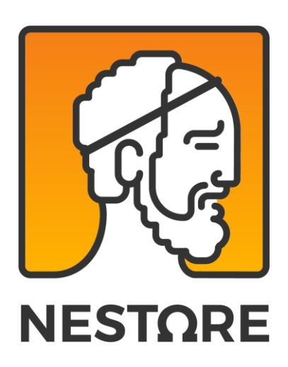
Figure 2 - NESTORE Vertical Logo

For images, human presence has been preferred to abstractive composition or drawings.